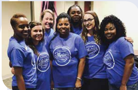
Some of the Magnolia FCU Dream Makers.

As a credit union, we care more about you than chasing huge profits. If your finances are holding you down, you want to learn the basics, or just to confirm what you know, come see us at Magnolia because dreams thrive here!